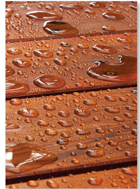
Repels water from the inside out