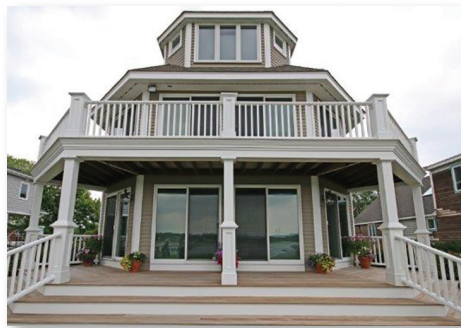
Deck sealed with C2 Guard and left natural to age