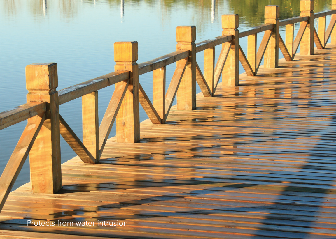
Protects from water intrusion