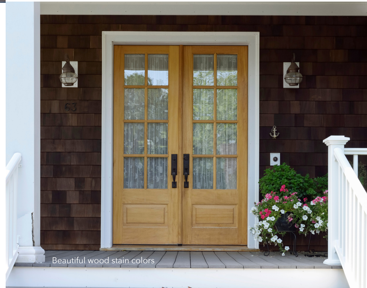
Beautiful wood stain colors