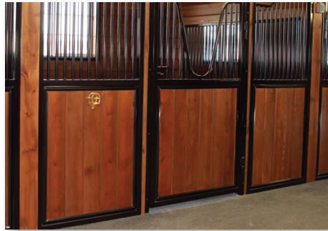
Barn treated with C2 Guard Fusion