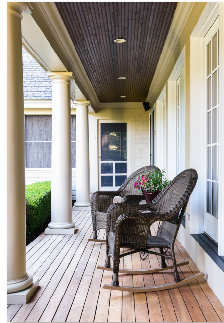
C2 Guard Wood on deck and ceiling